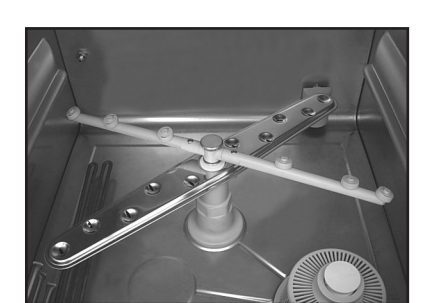
Upper and lower wash and rinse arms guarantee excellent results.