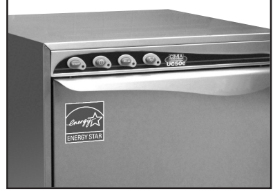
Top mounted controls are easy to read and simple to operate.