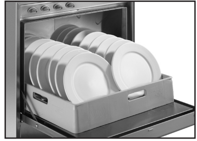
Large 13" maximum loading height door clearance accommodates oversized plates, glasses and utensils.