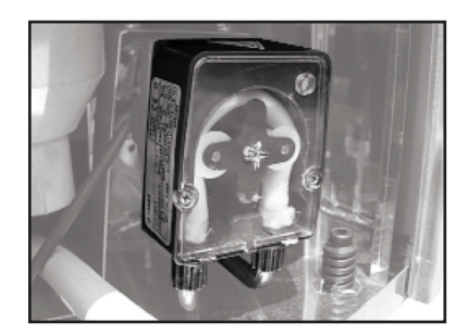
Built-in detergent and rinse chemical pumps.